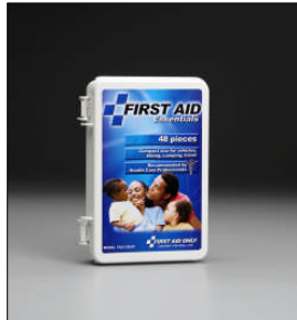
FAO-120- 48 Piece Hard sided Auto First Aid Kit — $8.00