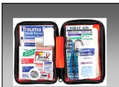
FAO-420- 107 Piece Soft sided Outdoor First Aid Kit — $15.00